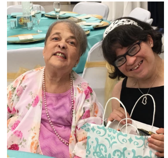
Cinderella Fella Ball