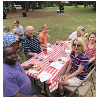
Knights of Columbus Picnic