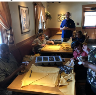
Olive Garden Enclave