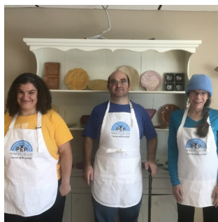
New PEP Artist Aprons