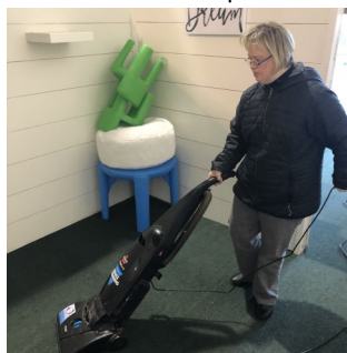
Cleaning the Carolina Dream Gym