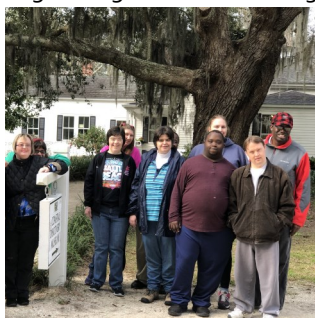
Honey Horn Plantation