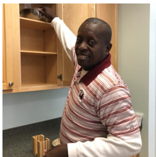
Organizing the New Building