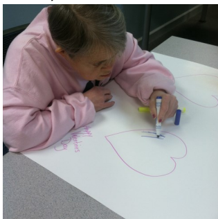
Valentine's Day Crafts