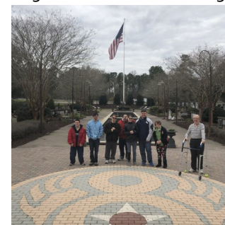
Mighty Eighth Museum