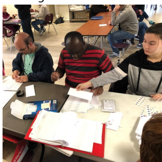
Working on a Contract Job