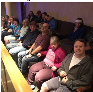
Seeing a Play