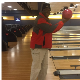
Bowling at Station 300