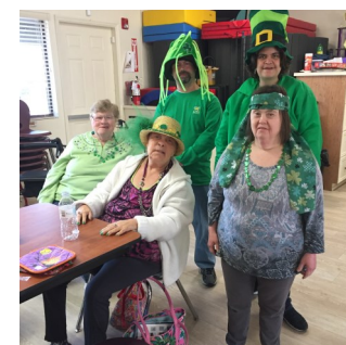
St. Patrick's Day