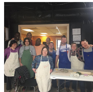
Ceramics in Bluffton