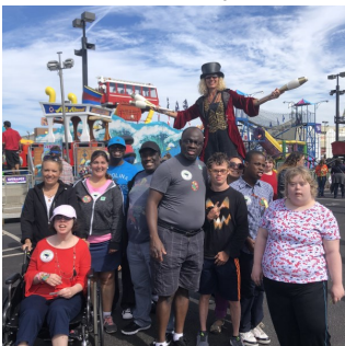
Trip to the State Fair