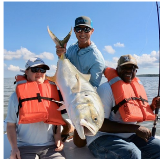
Fish with Friends Outing