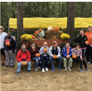
Hanging out at Holiday Farms