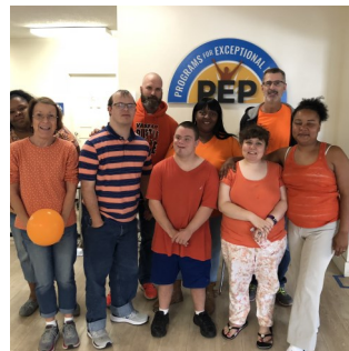
Wearing Orange for Unity Day