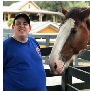
Visit to Lawton Stables