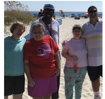
Walk on Coligny Beach