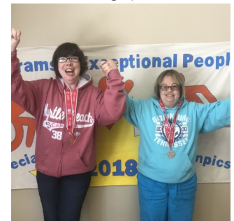
Special Olympics Winners