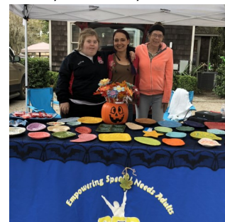
Bluffton Farmers Market