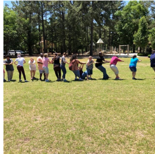
Tug of War with KoC