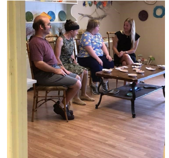
Filming Girl Talk