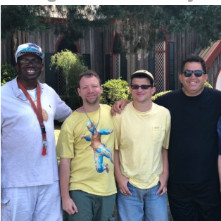
Church of the Cross Visit