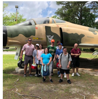
Mighty Eighth Museum