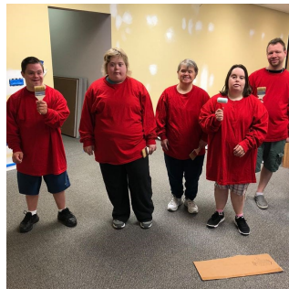
Painting New Building