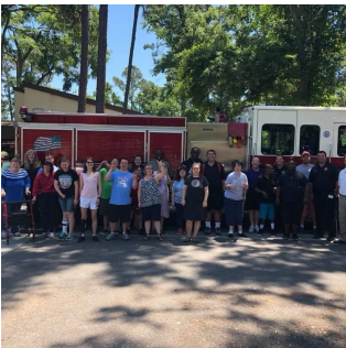
Firefighter Pizza Party