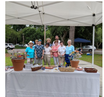
All Saints Garden Tour