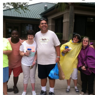
Water Company Visit